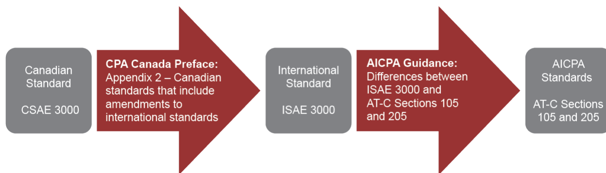
Figure 1: How to bridge between performing an engagement under CSAE 3000 and AT-C Sections 105 and 205

When issuing a SOC 1 report under both Canadian and U.S. standards, in addition to complying with both CSAE 3000 and AT-C Sections 105 and 205, the practitioner is also required to comply with CSAE 3416 and AT-C Section 320. Aside from a few specific circumstances where CSAE 3416 requirements go beyond those of AT-C Section 320 (noted in Appendix B ), the two standards are aligned.